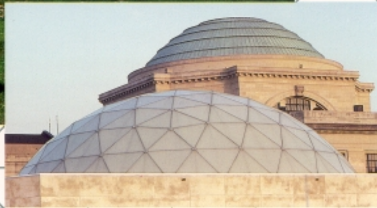
94' diameter TEMCOR Aluminum Dome

USE: Universe Planetarium and Space Theatre